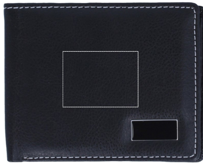
2. WALLET FRONT