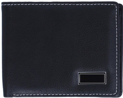
1. METAL PLATE